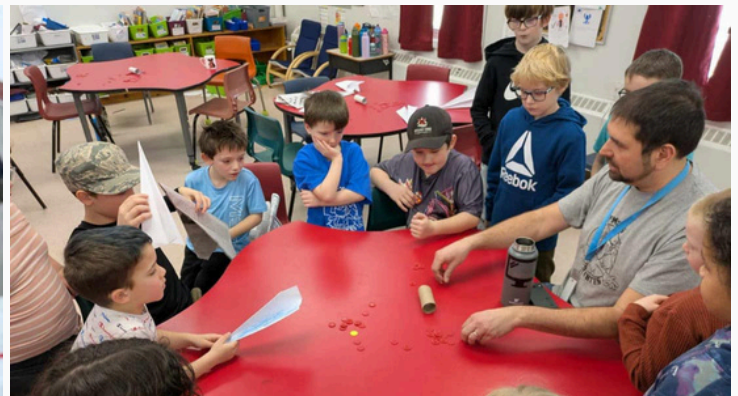
Students at Port Maitland Consolidated Elementary School participate in STEM (Science, technology, engineering, and mathematics) exploration activities (pictured above).